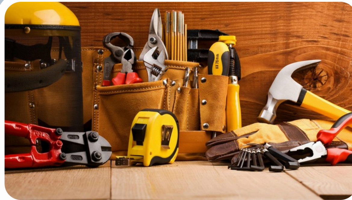
General Industrial Supplies