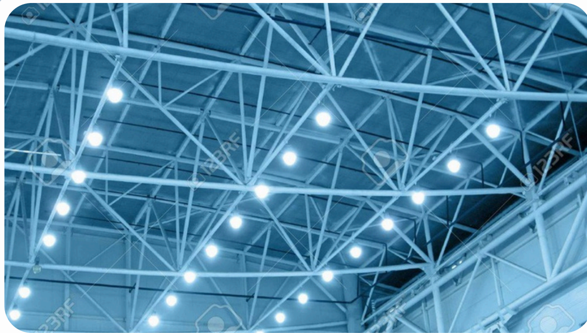
Industrial & Commercial Lighting