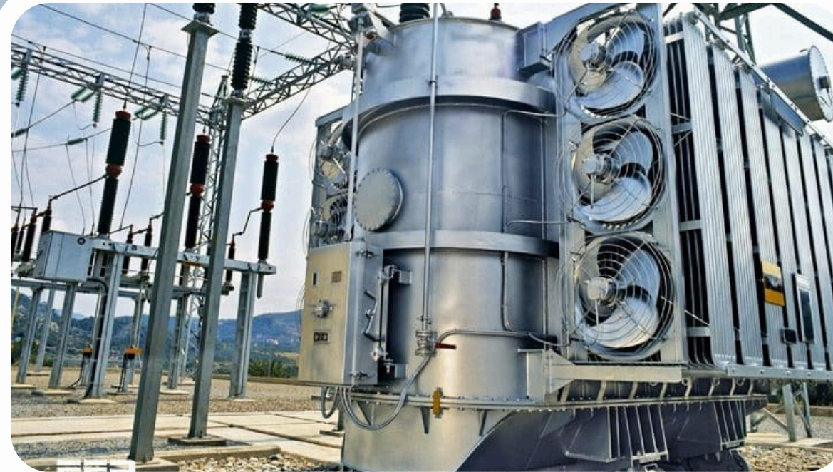
LV & HV Electrical Equipment