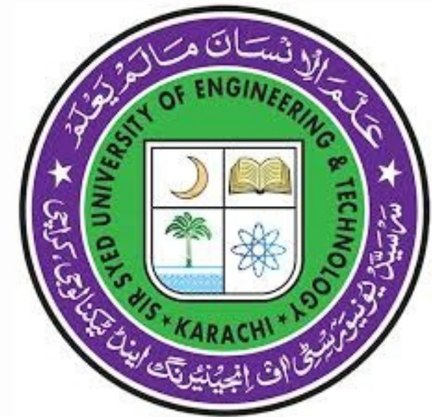
Sir Syed University