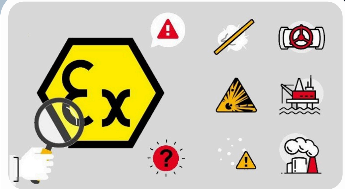
Ex Rated / Explosion Proof Equipment