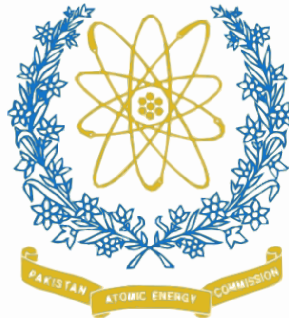
Pakistan Nuclear Energy Commission