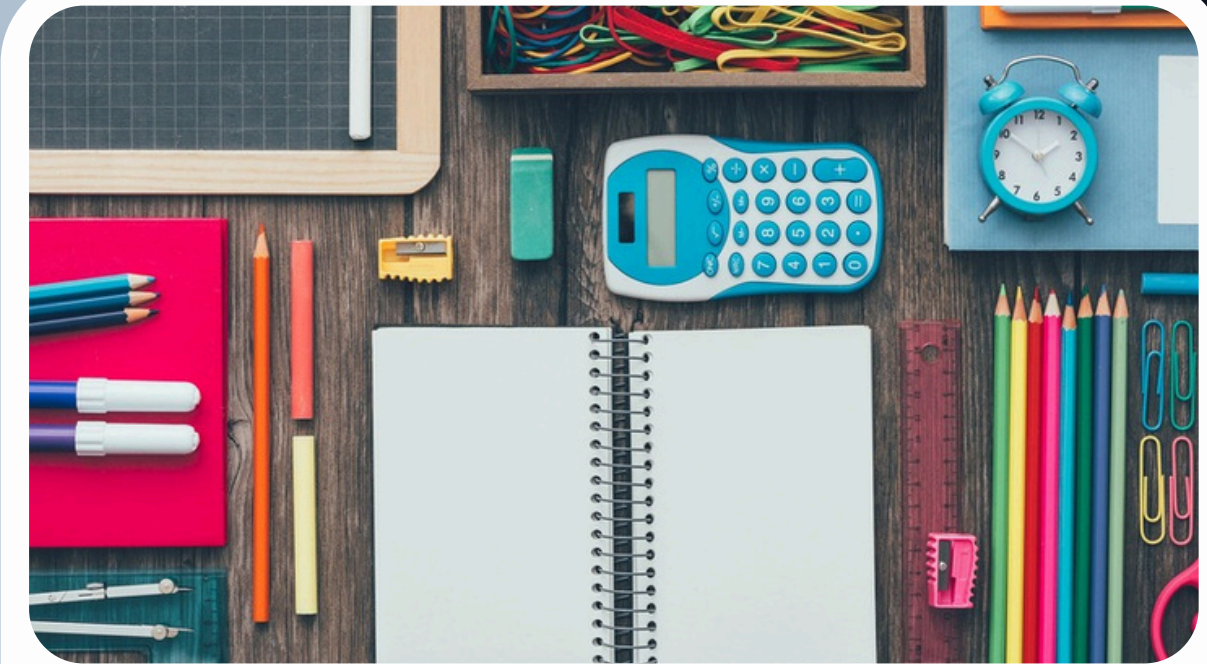
General Office Supplies